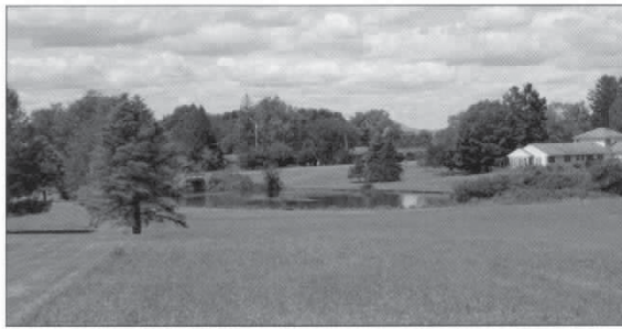
GERMANTOWN - 11+ acre building lot on a quiet country road, BOHA. Catskill views and there is a small pond on the property. Land is cleared with a great pasture area; a very special property. Germantown schools. Offered at $255,000