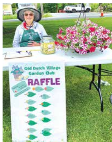
Get your Raffle Ticket

By Nancy Bendiner and Felice Gelman Local residents flocked to the long-anticipated annual Old Dutch Village Garden Club plant sale on May 20. What a relief that the rain held off until after the sale! At Memorial Park in Red Hook across from CVS, over 1200 plants — herbs, perennials, shrubs, even trees — were offered at bargain prices. Donated from community gardens, the perennials were a colorful display. When the sale opened at 9 AM dozens of buyers, who had been lining up, rushed to find their favorites. Within two hours, almost every plant was sold! Once the plants are in their new owners' gardens, the result will be beauty to inspire us all!