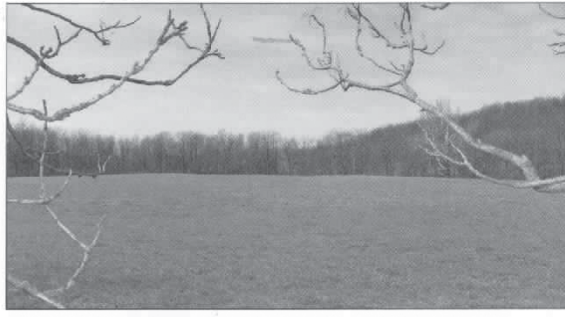
GREEN PASTURES FARM - 188 rolling acres located in historic Livingston with frontage on CR -19. Five miles from Taconic parkway, located halfway between Rhinebeck and Hudson. Exceptional parcel for continued agricultural use or livestock. Excellent gravel soil and great Catskill views to the west. Development possible w/2 acre zoning, which also allows camp sites. Hard to find large parcels that are high and dry. Offered at $1,795,000