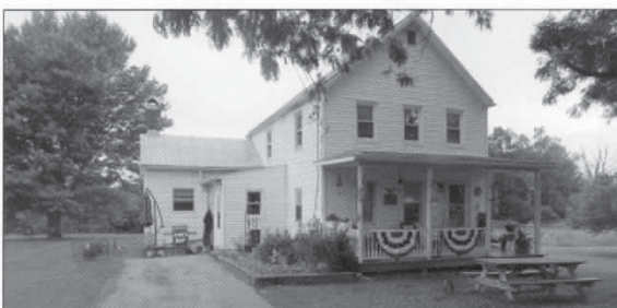
TIVOLI - Charming 3BR, 2BA farmhouse w/ original detail, in excellent condition w/updates. Has 1BR apartment, separate entrance & deck. Also a 3000+ building for many uses - commercial, retail, art studio or gallery. High visibility, large outside storage. Has Catskill views. Very good live/work opportunity. New to market. Offered at $1,250,000