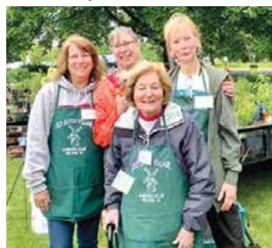
Some of the many volunteers