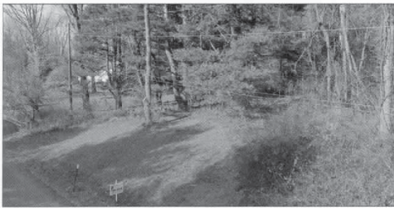
RED HOOK - 1.3 acre approved lot in quiet subdivision, minutes to the Village of Red Hook. In a wooded area of quality homes. BOHA extension applied for. Offered at $145,000