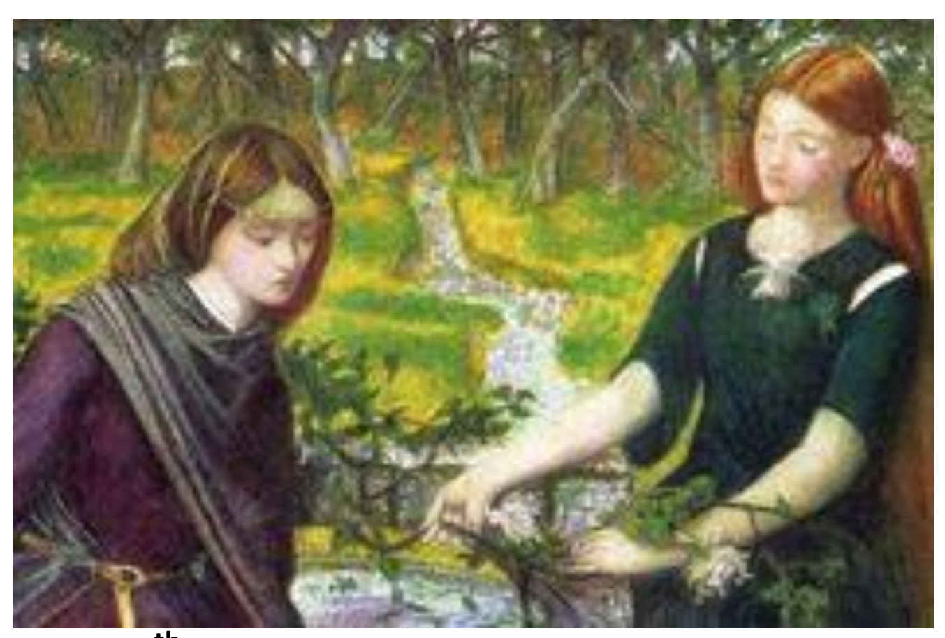
26<sup>th</sup> July, 2020 – Eighth Sunday after Pentecost

St George's, Trentham 9.00am | St Mary's, Woodend 11.00am