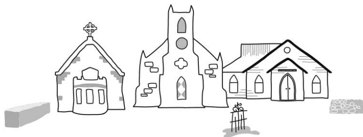
THE Anglican Parish of Woodend-Trentham