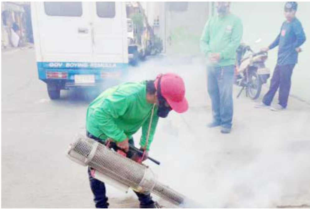
FOGGING, MISTING. The City Epidemiology and Surveillance Unit and City Health Office of General Trias City conduct fogging and misting operations in MariCris Subdivision, Barangay Pasong Camachile II on Thursday (Feb. 27, 2025), to combat the rise in dengue cases. The efforts are part of a province-wide response to the 409-percent increase in cases in the province since Jan. 1.

Bacoor City, February 27, 2025 – The City Government of Bacoor, through the City Planning & Development Coordinating Office (CPDC), held a meeting with representatives from the Department of Public Works and Highways (DPWH) yesterday to discuss collaboration on infrastructure projects in the city. The meeting, held at the SBR Conference Room, >> P2