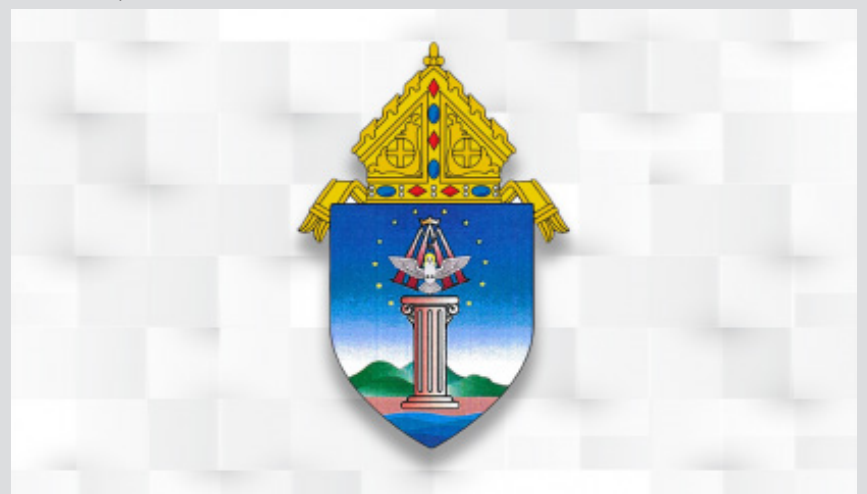
Diocese of Imus logo

Topics to be discussed include a history of Church reforms and under-