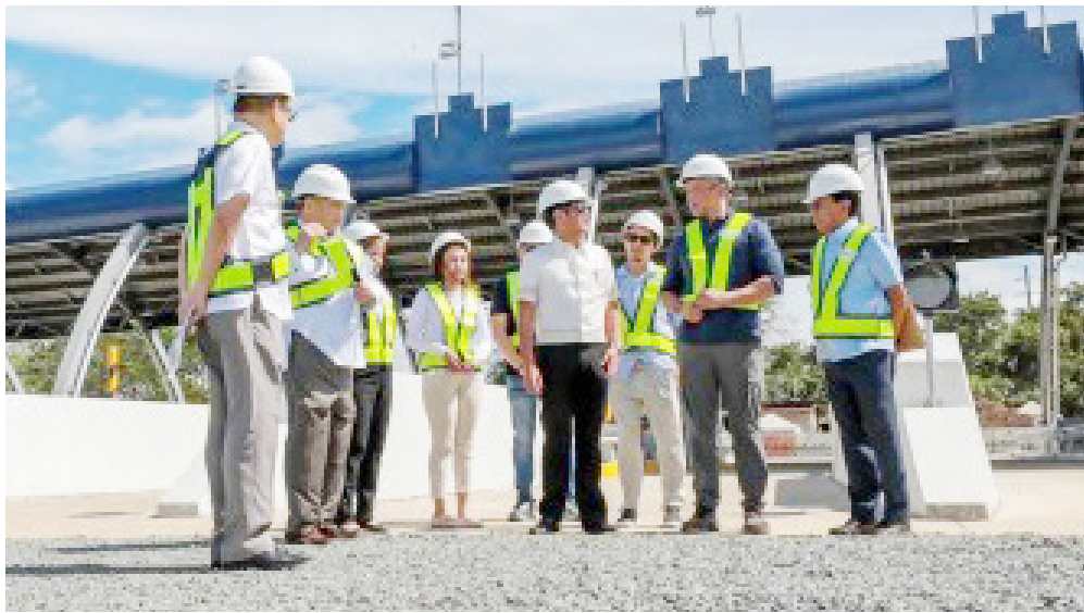
EASING CONGESTION. President Ferdinand R. Marcos Jr. inspects the ongoing construction of the Cavite-Laguna Expressway (CALAX) Governor's Drive Interchange in General Trias, Cavite, on Friday (March 21, 2025). The project, currently 44 percent complete, aims to ease traffic congestion and improve connectivity between key economic hubs.