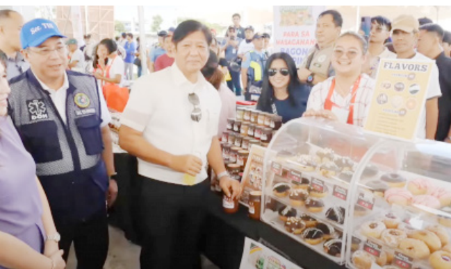
GOV'T SERVICES. President Ferdinand R. Marcos Jr. launches the "Trabaho at Serbisyong Pangkalusugan sa Bagong Pilipinas" initiative on Friday (March 21, 2025) at the Dasmariñas Arena in Cavite province. The event featured job fairs, medical missions, and affordable food stalls to assist local residents.

Around 3,000 job seekers, including graduates of the Pantawid Pamilyang Pilipino Program (4Ps) and beneficiaries of the Assistance to Individuals in Crisis Situation (AICS), joined the activity. The DOLE also distributed PHP5,600 each to 500 beneficiaries of the Tulong Panghanapbuhay sa Ating Disadvantaged/Displaced Workers or TUPAD program and awarded various livelihood and financial aids under the DOLE Integrated Livelihood Program. The Department of Health conducted a medical mission offering services such as laboratory screenings, electrocardiograms or ECGs, X-rays, medical consultations, pneumonia vaccinations, and the provision of medicines. Additionally, the