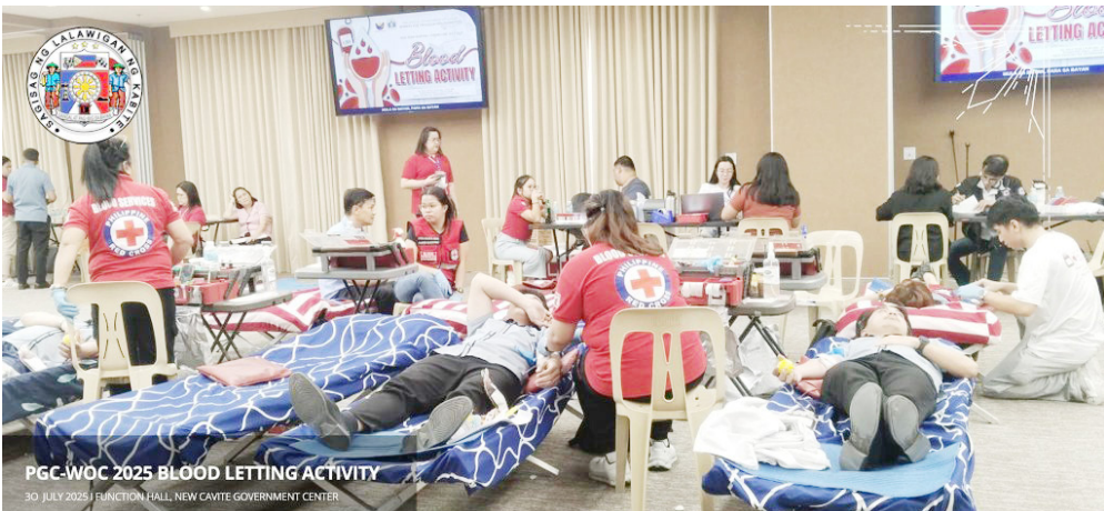
PGC-WOC 2025 BLOOD LETTING ACTIVITY 30 JULY 2025 | FUNCTION HALL, NEW CAVITE GOVERNMENT CENTER