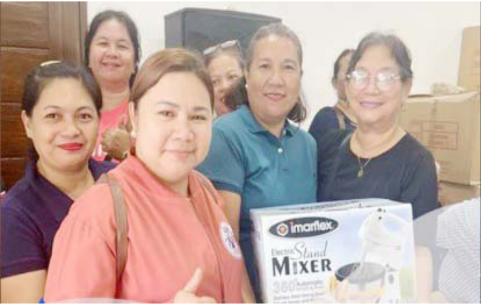
LIVELIHOOD AID. The Department of Labor and Employment (DOLE) Cavite Provincial Office has granted livelihood packages worth PHP2 million to seasonal workers on Sept. 10 and 11, 2024 at its office in Dasmariñas City. Some parolees also received assistance packages worth PHP591,395 in Imus City on Sept. 10.