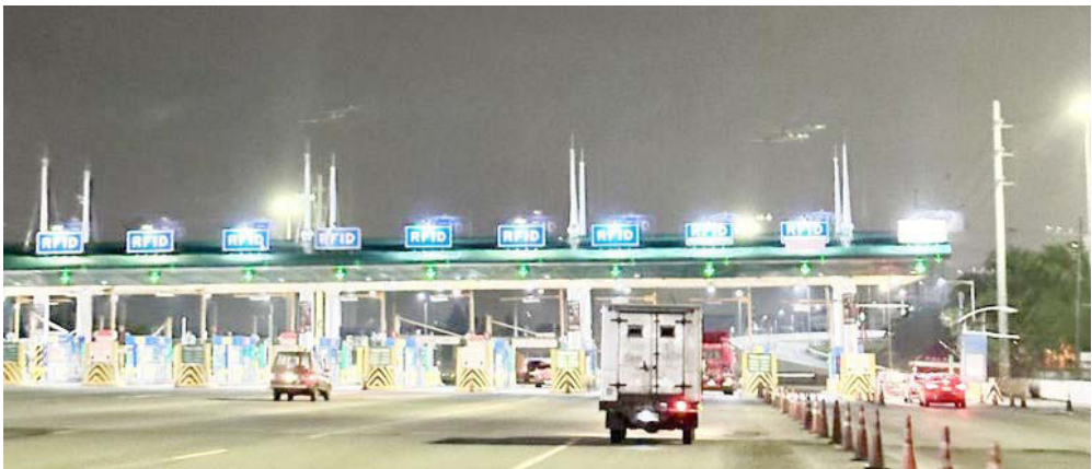
Motorists slow down as they approach a toll plaza of the Manila-Cavite Toll Expressway (CAVITEX) before dawn on Saturday, September 14, 2024, the first day of the dry run of the cashless toll collection. During the dry run, those passing the Parañaque and Kawit toll plazas without RFID stickers will be required to have one installed, the operator said. After the dry run, motorists without RFID stickers will be fined P1,000 for the first offense, P2,000 for the second offense, and P5,000 for subsequent offenses.