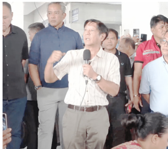
Marcos eyes revisiting Bicol River Basin Development Project

"Under the Philippine-Korean project facilitation, yung Bicol River basin flood control project was already updated only this July 2024 including the feasibility study for the flood control program. By early next year, we'll be doing the digital en-