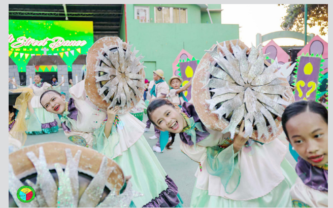
Tinapang Salinas Festival street dance competition held on Oct. 18

Fishing is the primary livelihood of many residents of the coastal municipality hailed as the Tinapang Salinas Capital of the Philippines.