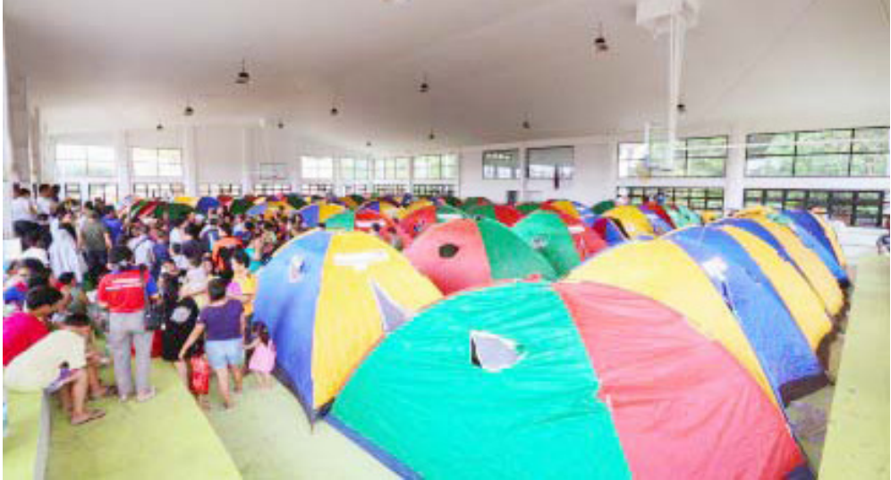
Batangas province evacuation center