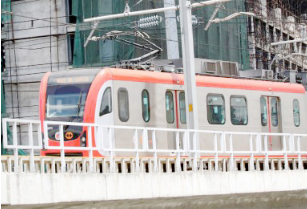
A Light Rail Transit Line1 (LRT-1) train at the Redemptorist station in Parañaque City