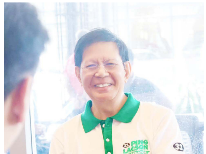
Panfilo "Ping" Lacson

"Of course, we respect our senator whose BRAVE program gives special attention to the small towns," the lady mayor said in Filipino at the proclamation rally of Team 1GMA, on the first day of the campaign season for local officials on Friday,