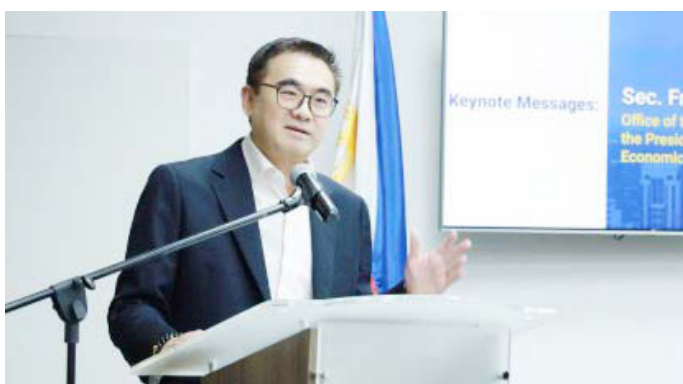
Finance Secretary Frederick Go