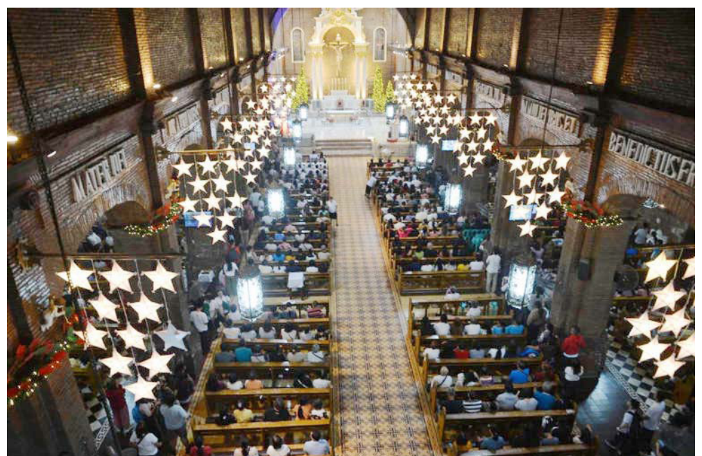
IMUS CATHEDRAL The Shrine of Our Lady of the Pillar or Imus Cathedral is one of 20 Jubilee churches in the province of Cavite.

These churches were declared Jubilee pilgrim churches and will serve as places of pilgrimage for the special "time of spiritual renewal and grace for the universal Church," emphasizing