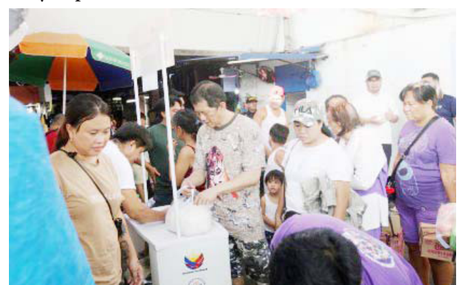
CHEAPER RICE. Buyers line up to buy PHP40/kg. rice at the Kadiwa ng Pangulo kiosk in Malabon Central Market in Malabon City on December 5, 2024. The Department of Agriculture on Monday (Jan. 6, 2025) said Sulit rice, which will be sold for PHP38/kg., will be soon be available in 24 KNP sites in Metro Manila.

"So, iyong 24 na pamilyan at LRT, MRT stations, doon din ilalagay muna. And then target natin nga na madagdagan pa ito (So, it will be available in the exist-