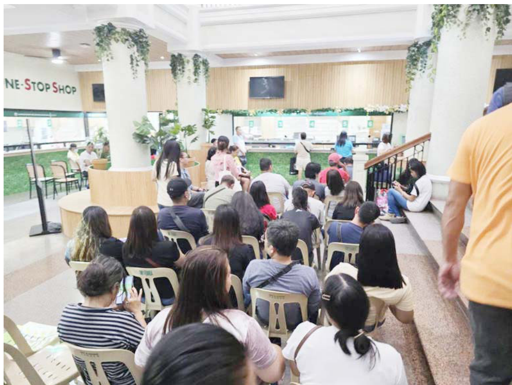
EARLY PAYMENT OF TAXES Investors and residents of General Trias patiently wait to pay taxes through a GenTri Electronic Business One-Stop Shop in Barangay Bagumbayan as early as Dec. 27, 2024, to avail of the discount from the local government unit for the tax they need to pay in 2025.