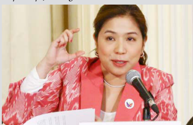
Budget Secretary Amenah Pangandaman

Government workers may now receive their medical allowance as the Department of Budget and Management (DBM) approves the guidelines on the grant of the PHP7,000 medical allowance for 2025. The DBM said Budget Secretary Amenah Pangandaman approved Budget Circular 2024-6, which lays out the guidelines, rules and regulations on the grant of the medical allowance.