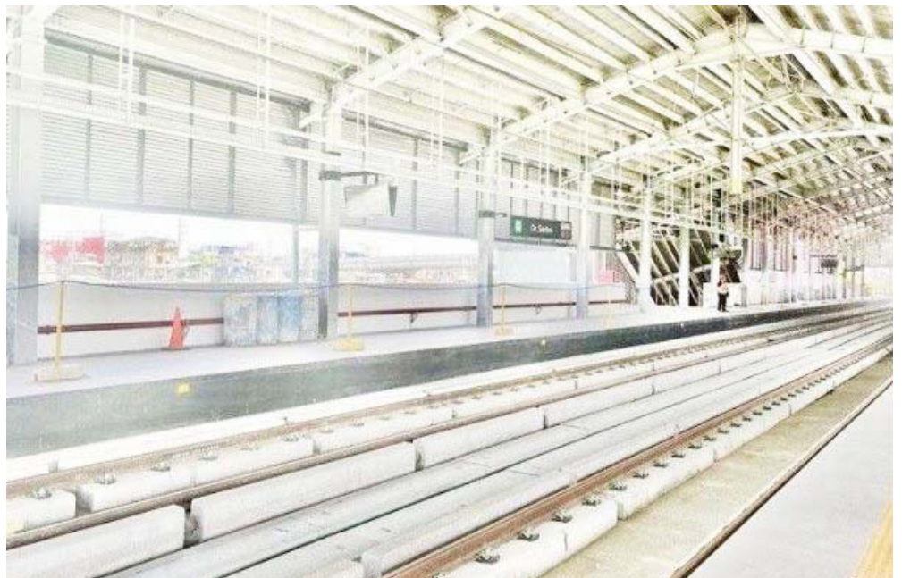
Government to redesign LRT-1 Cavite line