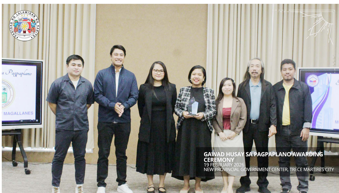
GAWAD HUSAY SA PAGPAPALANO AWARDING CEREMONY 19 FEBRUARY 2026 NEW PROVINCIAL GOVERNMENT CENTER, TRECE MARTIRES CITY