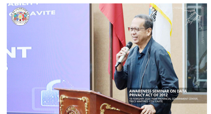
AWARENESS SEMINAR ON DATA PRIVACY ACT OF 2012 19 FEBRUARY 2026 NEW PROVINCIAL GOVERNMENT CENTER, TRECE MARTIRES CITY, CAVITE

The Provincial Government of Cavite (PGC) successfully conducted a seminar entitled “Promoting Data Privacy Compliance and Accountability under the Data Privacy Act of 2012: An Awareness Seminar for Department Heads and Medical Practitioners in the Provincial Government of Cavite” at the Function Hall of the New Provincial