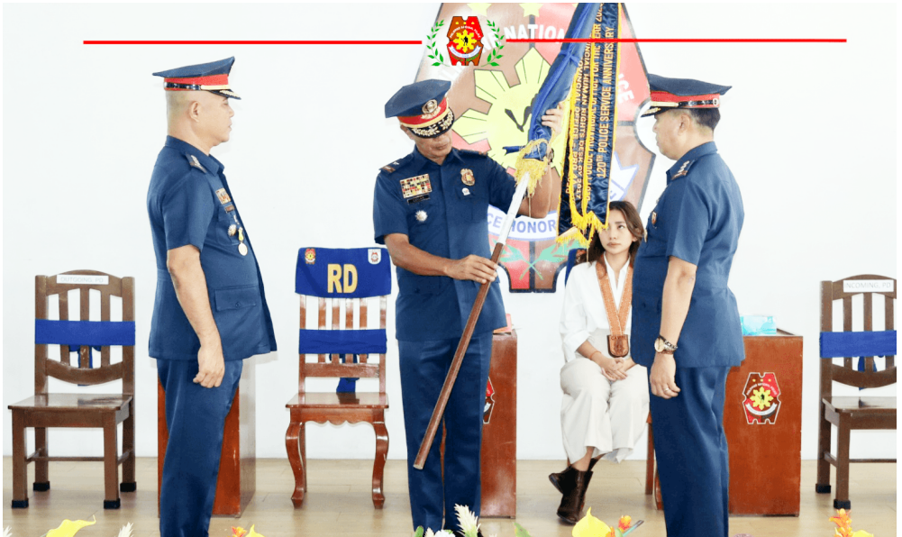
Col. Dwight E. Alegre officially assumed the role of acting Cavite PPO director on October 28