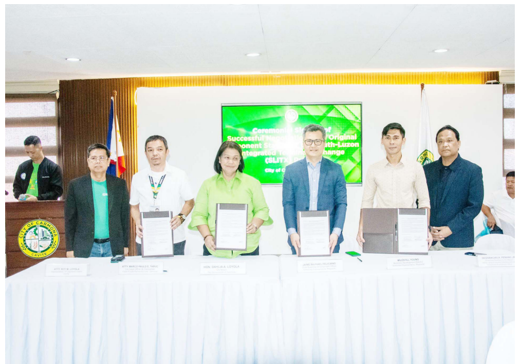
Ceremonial signing of the certificate of successful negotiations and original proponent status for the South-Luzon Integrated Terminal Exchange Project at the Carmona City Hall on Feb. 17

“Ito na ang panahon para suportahan natin, ilabas natin yung commercial and business district outside Metro Manila para lumuwag ang Metro Manila, para ang mga taga-probinsya, hindi na pupunta sa Metro Manila (This is the time to support and develop commercial and business districts outside Metro Manila to ease congestion in Metro Manila. This way, people from the provinces no longer need to travel to Metro Manila).”