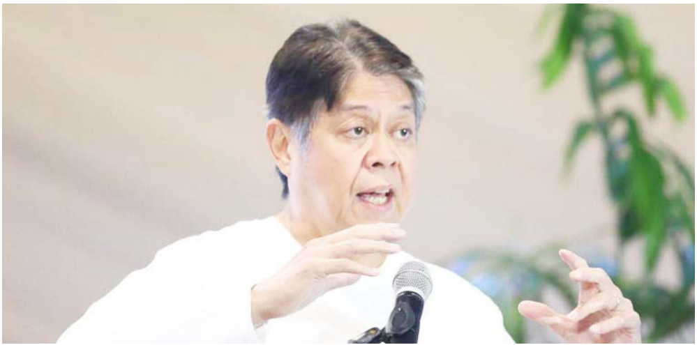
Pangilinan, Aquino to start campaign in Cavite