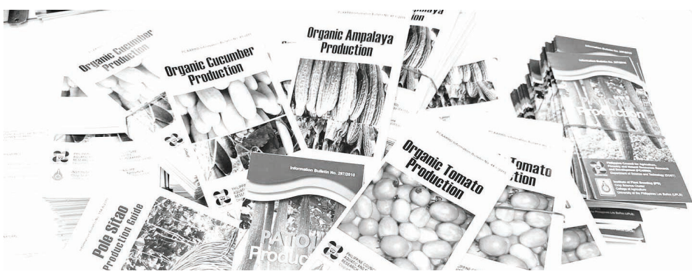
IEC materials on vegetable production guide turned over to DA-BPI

Aside from these flyers, DOST-PCAARRD will be sending electronic copies of its IEC materials to DA-BPI for dispersal and greater reach.