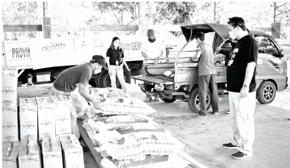
Various AboitizPower business units, in partnership with Aboitiz Foundation, have been providing assistance to their host beneficiaries amid the pandemic situation. The ER 1-94 funds will augment these efforts to help the local government units have enough resources in their fight against COVID-19.

Aboitiz Power Corporation (AboitizPower) welcomes the recent move of the Department of Energy (DOE), allowing communities that host power generation projects to use their revenue shares from these facilities to help them combat the effects of COVID-19.