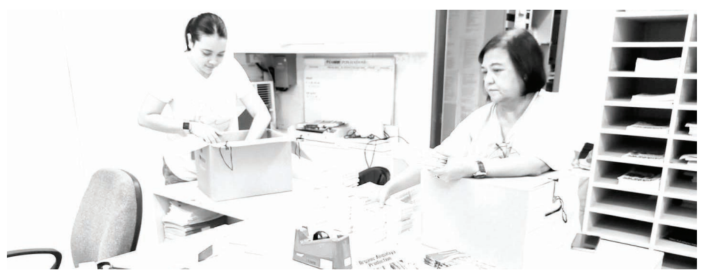
PCAARRD-Applied Communication Division (ACD) staff members assisting in packaging the IEC materials