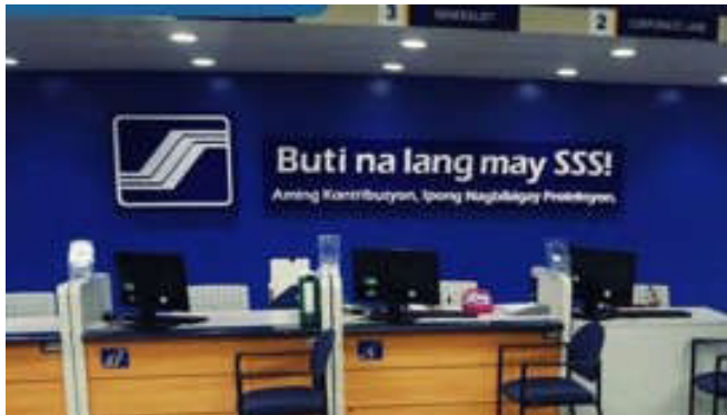
SSS to members in MECQ areas: Go online, use drop boxes

Branches not affected by the MECQ declaration will follow the regular working hours of 8 a.m. to 5 p.m. For more information, follow the SSS on Facebook and YouTube at "Philippine Social Security System," Instagram at "mysssp," and Twitter at "PHLSSS," or join the SSS Viber Community at "MYSSSPH Updates."