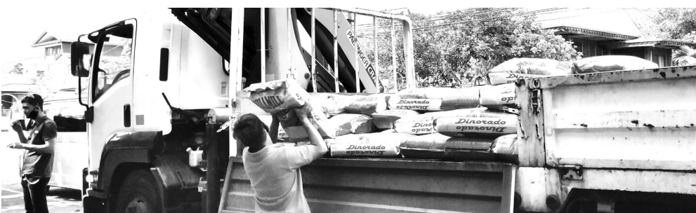
Amidst the Luzon-wide enhanced community quarantine in Luzon, APRI and AFI ensure that its neighboring communities have a sufficient supply of food.

FOOD SECURITY AMIDST COVID-19 - Aboitiz Foundation, Inc. (AFI), through the Aboitiz-Power subsidiaries AP Renewables Inc. (APRI) and San Carlos Sun Power, Inc. (SacaSun), continued to assist its host communities in its fight against COVID-19