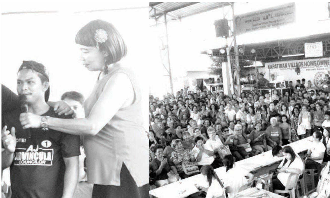
TRECE MARTIRES, Cavite, Apr. 13 (PIA) -- In the spirit of transparency, Cavite Governor Jonvic Remulla declared the Provincial Government of Cavite will receive an estimate of Php200M from the National Government Disbursement Program.

The Governor revealed he intends to use the amount to fund the mass testing of the groups of people most vulnerable to the coronavirus disease (COVID)-19.