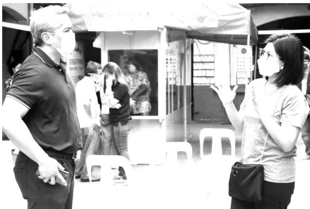
Cavite Gov. Jonvic Remulla talks to Bacoor City Mayor Lani Mercado during the turn-over and setting-up of mass testing facilities donated by the provincial government to the city government of Bacoor.

CITY OF BACOOR, Cavite Apr. 17 (PIA) -- About 32 patients suspected to be infected with the coronavirus disease (COVID)-19 who were isolated in a quarantine facility were subjected to swab testing on April 14, 2020.