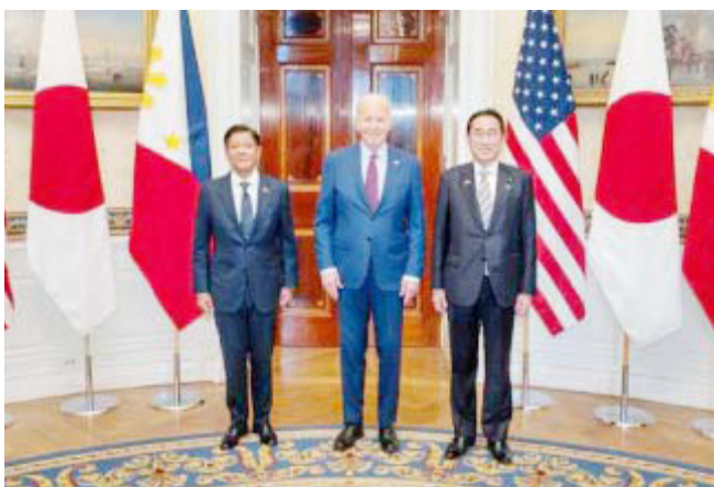
Philippine President Ferdinand R. Marcos Jr., United States President Joe Biden and Japanese Prime Minister Fumio Kishida (from left)

He noted that the US and Japan committed to continue their support for Philippine defense modernization priorities and upgrading the capa-