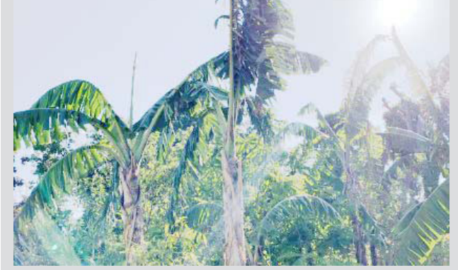
SCORCHING SUN. Wilted vegetation in this farm in Cuenca, Batangas, as seen on Monday (March 25, 2024) gives a glimpse of the effects of El Niño on food production. The Department of Agriculture-Calabarzon has launched interventions to keep farms in the region viable through the drought.

The Department of Agriculture in Calabarzon (DA-4A) is implementing various interventions to mitigate the effects of El Niño on farm- >> P3