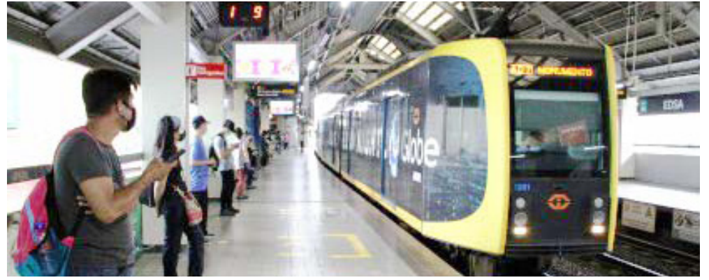
TEMPORARY SHUTDOWN. Passengers wait for the train at an LRT-1 station in this undated photo. Several government agencies on Wednesday (March 27, 2024) deployed free-ride buses along the route of the LRT-1 to serve passengers affected by the rail line's temporary shutdown.

The temporary closure will allow the Light Rail Manila Corporation (LRMC), the private operator and maintenance provider of the LRT-1, to conduct annual preventive maintenance activities as well as facilitate the testing activities for the system integration of the LRT-1 Cavite Extension. (PNA)