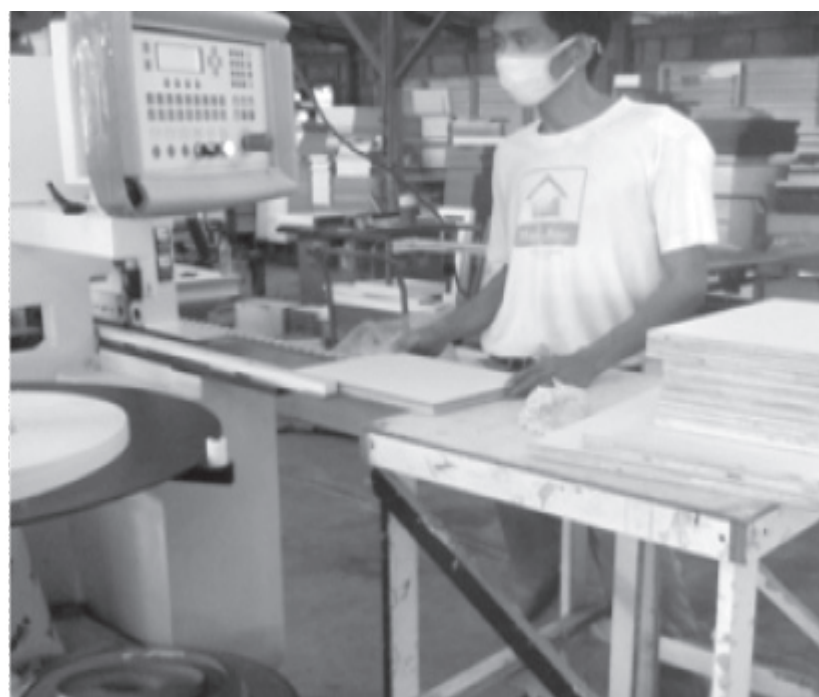
DOST SETUP. An artisan of the San Jose Kitchen Cabinet manufacturing factory in Carmona, Cavite enjoys science and technology (S&T)-based wood cutting machine operation and assembly for the furniture venture through the support of the Department of Science and Technology (DOST) Calabarzon's Small Enterprise Technology Upgrade Program (SETUP). The DOST SETUP assistance enabled the furniture business to acquire automatic edge bander worth PHP1.998 million, along with various trainings provided for staff capability development.