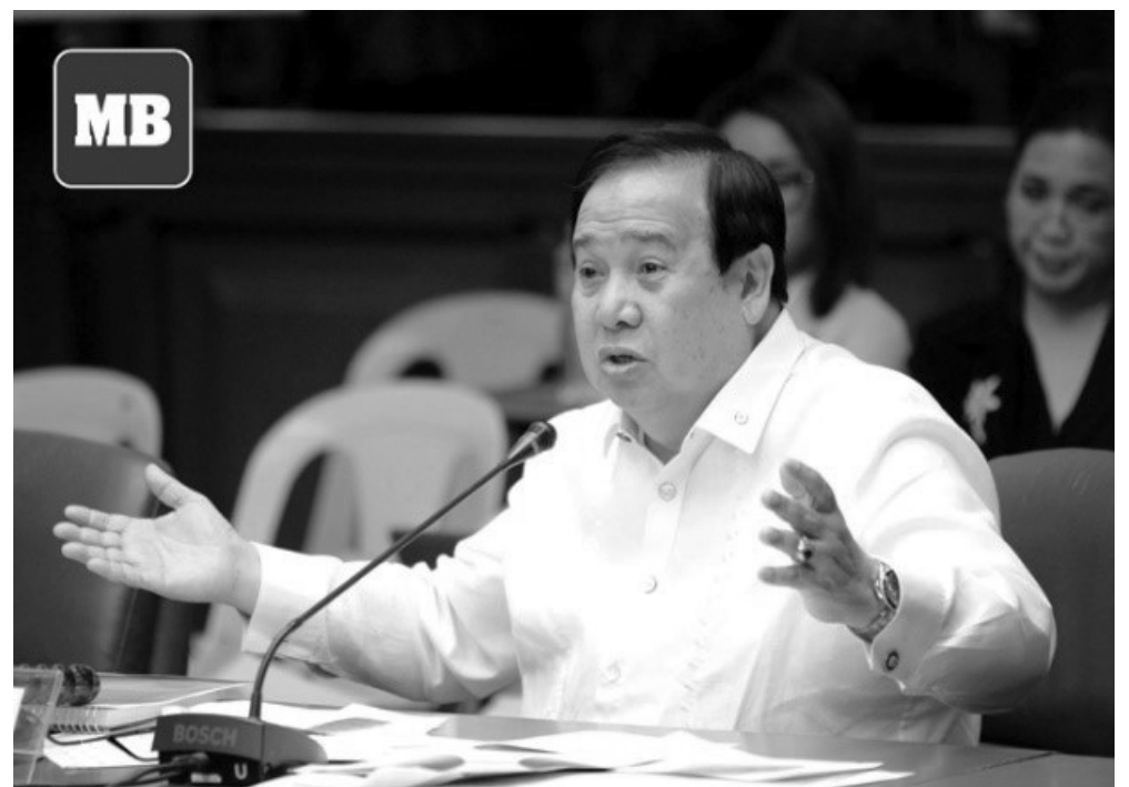
PRC Chairman Richard Gordon

PRC National Headquarters on Wednesday sent 85 units of frozen blood products to Tacloban and Palawan.