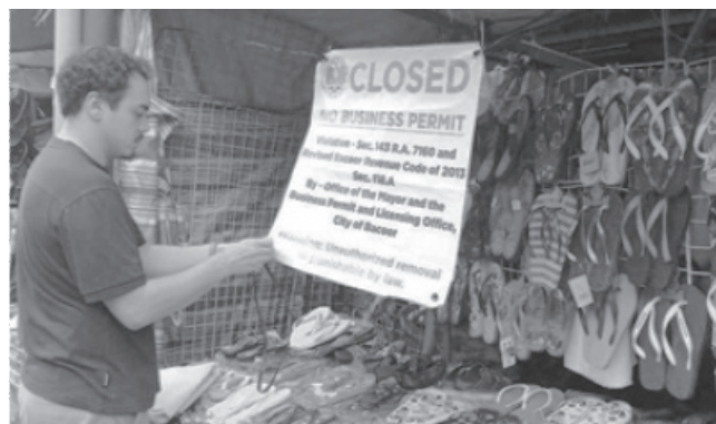
NO BUSINESS PERMITS. A team member from the Bacoor City Business and Licensing Office places the Closure Order tarp signage in one of the 21 stalls which were found to have no business permits during clearing operations on roads and the sidewalks within the Zapote Public Market in Bacoor City, Cavite on Aug. 15, 2019. The move is in compliance with President Rodrigo Duterte's order to rid public roads of obstructions.