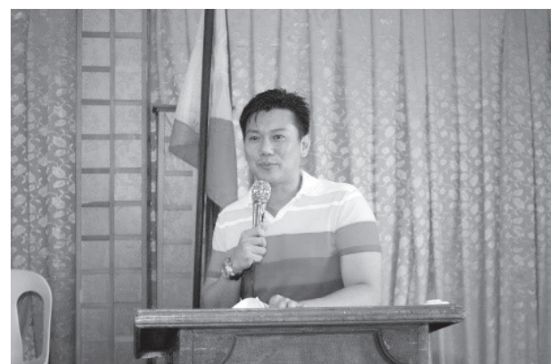
Cavite Mayor Emmanuel Leonard Maliksi

IMUS CITY, Cavite—The mettle of the local government in ridding off roads and sidewalks of obstructions would be put to a test as actions have already started in the turf. Mayor Emmanuel Leonardo Maliksi has distributed on Wednesday (August 14) to barangay (village) captains the copies of the memorandum from Department of the Interior and Local Government (DILG) directing the removal of obstructions on roads/sidewalks.