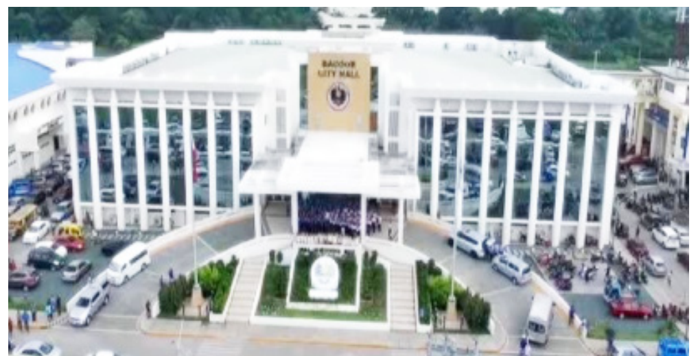
Bacoor City Hall

She, however, said nine of the 10 family members of the Addas 2C index case have been tested positive for