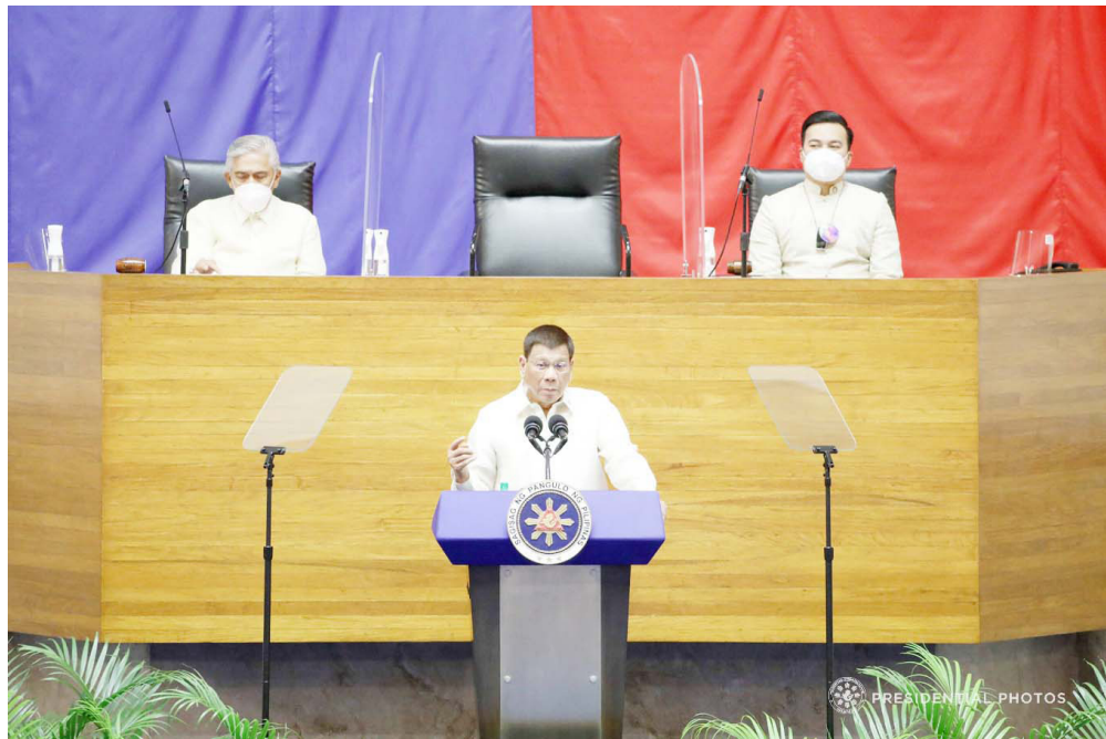
President Rodrigo Roa Duterte delivers his 6th State of the Nation Address at the Batasang Pambansa in Quezon City on July 26, 2021.

President Rodrigo Roa Duterte said the imposition of lockdown is possible if the more transmissible COVID-19 Delta variant, which was already detected in the country, spreads further.