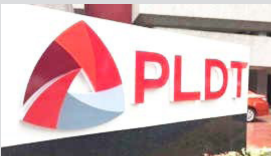
PLDT rolls out massive fiber network in Cavite province

Telco giant PLDT Inc. has teamed up with the local government of Cavite to help realize the province's digital roadmap of becoming a “Smart City” through the rollout of a massive fiber network.