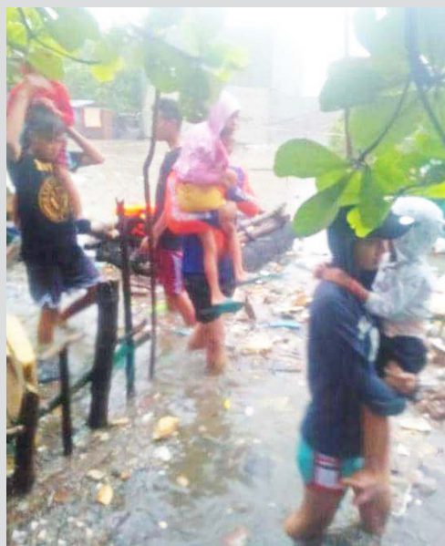
Personnel of the PCG Station Cavite rescued over 700 stranded residents were rescued in Naic, Ternate, and Noveleta in Cavite as continuous heavy rains caused massive flooding in the area on Saturday, July 24, 2021.

The rescued residents were evacuated to safer grounds in Bucana Sasahan Elementary School, Pueblo