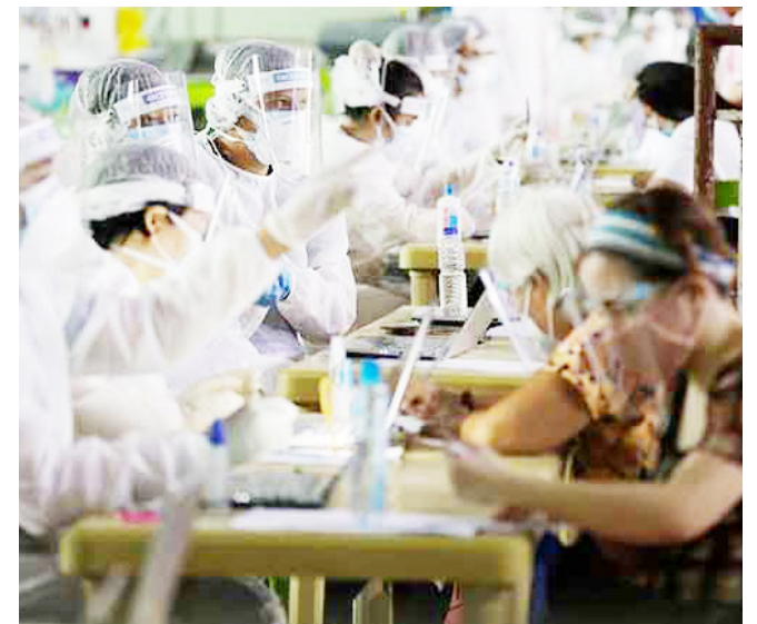
FREE TEST Health workers check residents at a free swab testing center in Navotas City on Aug. 6, 2020. The Philippines added 3,561 new virus cases on the same day as more Covid-19 tests are conducted.

Vega also revealed that the country's first integrated Covid-19 facility at the East Avenue Medical Center in Quezon City would be operational by August 17, and that the Quirino Memorial Medical Center would open within the month. A mod-