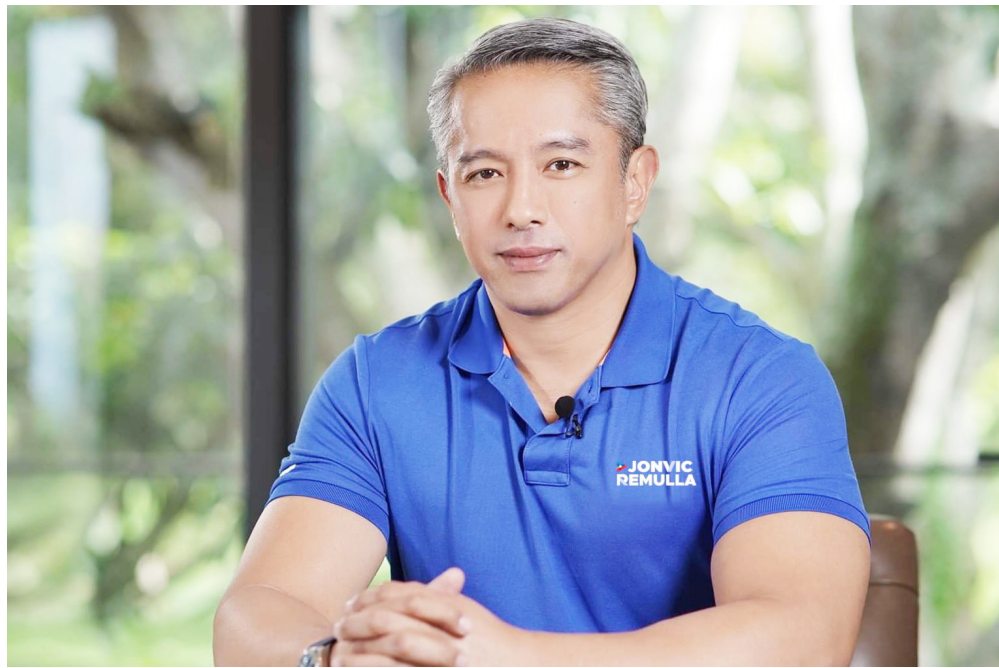
Cavite Governor Jonvic Remulla