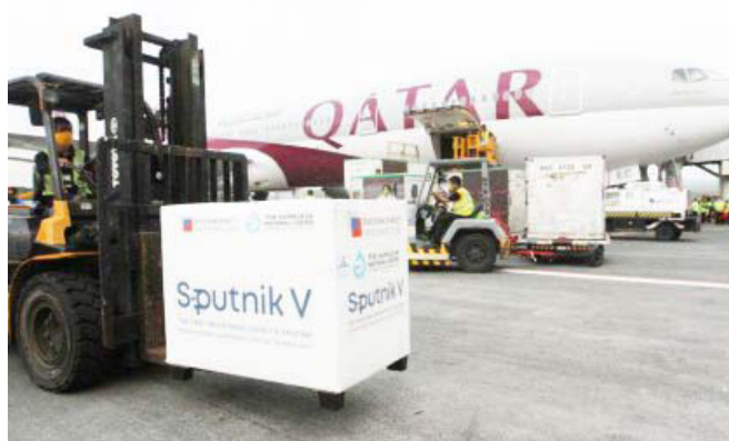
SPECIAL DELIVERY. The Qatar Airways flight carrying 15,000 doses of the Sputnik V Covid-19 jab lands at the Ninoy Aquino International Airport in Pasay City on Friday (Aug. 13, 2021). The shipment will add to the 42,091,150 doses delivered to the country since February.

New testing laboratories are also being planned in densely populated areas in Bicol, Palawan, and Iloilo, along with additional facilities in Laguna and Cavite. (PNA)