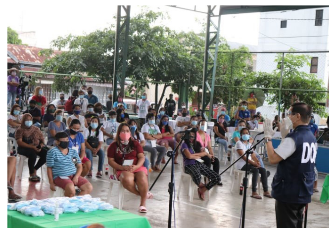
Health Sec. Francisco Duque III conveys to residents of Barangay Javalera in Gen. Trias President Rodrigo Roa Duterte's directive to strictly enforce minimum health standards in communities and to provide 20 million face masks to vulnerable sectors.