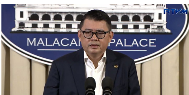
Presidential Adviser for Entrepreneurship and Go Negosyo founder Joey Concepcion