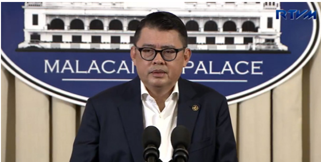
Presidential Adviser for Entrepreneurship and Go Negosyo founder Joey Concepcion