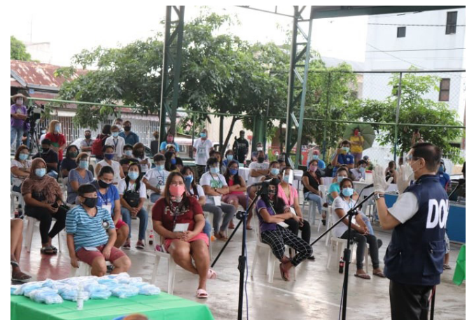
Health Sec. Francisco Duque III conveys to residents of Barangay Javalera in Gen. Trias President Rodrigo Roa Duterte's directive to strictly enforce minimum health standards in communities and to provide 20 million face masks to vulnerable sectors.