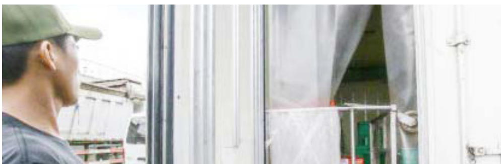
STRINGENT. A driver opens his delivery truck for inspection by the Bureau of Animal Industry and Quezon City Veterinary Department at a checkpoint in Commonwealth Avenue on Tuesday (Aug. 20, 2024). Other checkpoints aimed to help prevent the spread of the African swine fever are set up in Kaingin Road, Balintawak; Mindanao Avenue-Tandang Sora Avenue intersection; and Barangay Paang Bundok in Amoranto Street, La Loma.