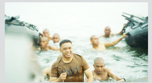
'HONORARY NAVY SEAL'. AFP chief Gen. Romeo Brawner Jr. joins the drills for the Navy Seals rites at Sangley Point, Cavite on Monday (Aug. 19, 2024). The specialized naval warfare drills include included rigorous warm-up exercises, boat paddling, swimming, one-mile run, and firing of .45-caliber pistol and sniper rifle.

"You have faced challenges that tested your limits and you have emerged as elite warriors ready to serve our nation. You embody the spirit of the Navy SEALs, courageous, disciplined, and committed to excellence and we have seen this countless times in action and in combat operations," he said. (PNA)