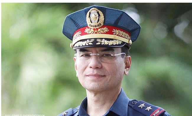
PNP Chief Police General Guillermo Lorenzo T Eleazar