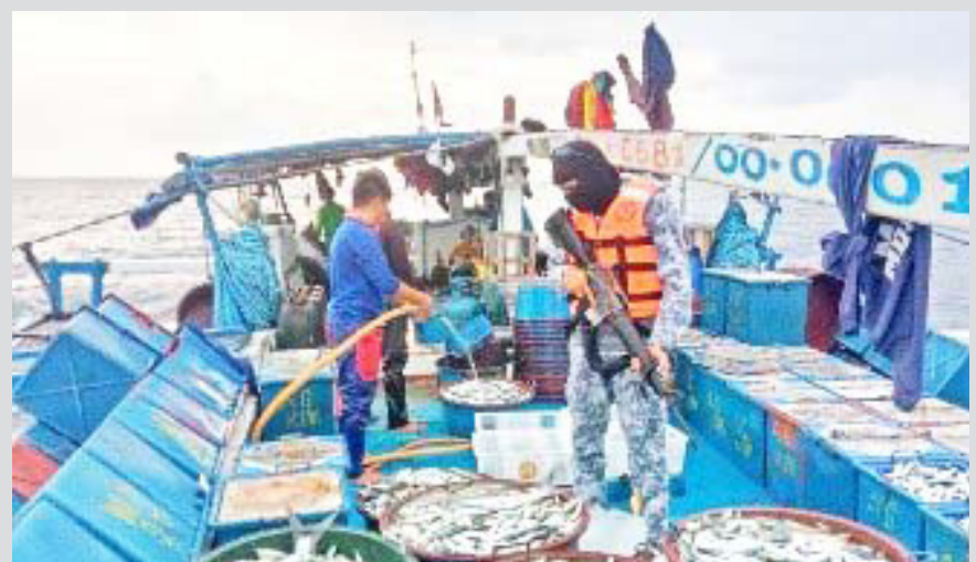
The Philippine Coast Guard (PCG) has arrested 31 local fishermen for illegal fishing off Naic, Cavite on Monday, Aug. 23, 2021.

The PCG said personnel of station Cavite remains active in conducting sea-borne patrols to apprehend illegal fishing in the area.