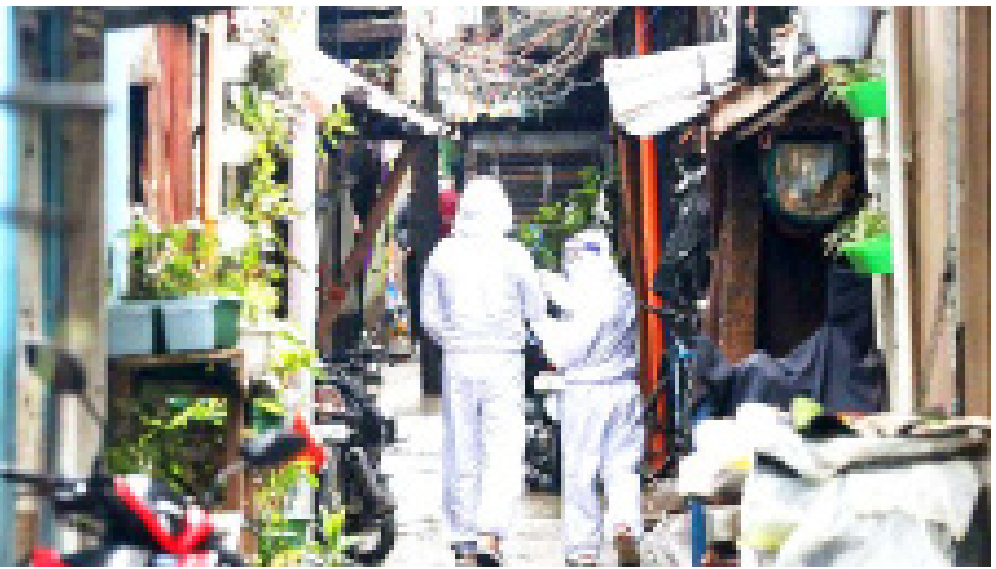
>> P5 Tracing czar and Baguio City Mayor Benjamin Magalong cites the lack of tracers as a major problem contact tracing programs will face against the threat of the Delta variant

As the Philippines faces threats from the highly transmissible Delta variant, local government officials said on Wednesday, August 4, that additional funds were needed to hire more contact tracers following the expiration of the Bayanihan 2 law last June 30. Tracing czar and Baguio City Mayor Benjamin Magalong told the House of Representatives health panel that the lack of funding to renew contracts and hire more tracers was now a major issue of the Philippines’ contact trac-