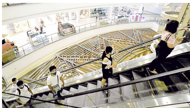
(File Photo) Shoppers wear face masks and face shield on a mall in Manila.