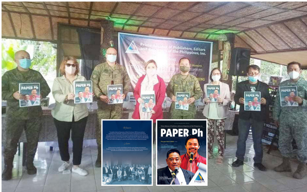
PAPER.Ph Magazine Launching