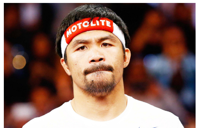
Manny Pacquiao is making multiple fighters sweat out the announcement of his next opponent.

After the decisive win, the 30-year-old did not spec-