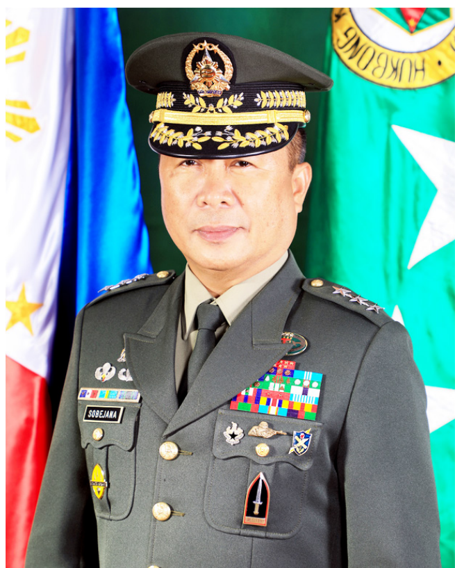
LT. GEN. CIRILITO E. SOBEJANA, Commanding General of the Philippine Army