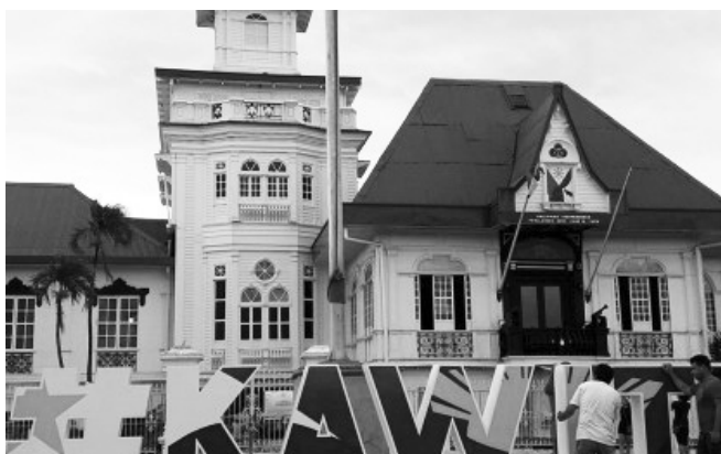
Facade of the Emilio F. Aguinaldo Shrine

KAWIT , Cavite -- This historic town is inviting the public to experience Christmas the "Kawitenyo" way by joining activities lined up for the season.