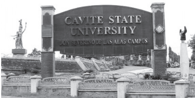
CAVITE STATE UNIVERSITY - A photo of the Cavite State University - Don Severino Delas Alas, its main campus located in Indang, Cavite.

INDANG, Cavite - A senior official of the state-run academic institution here fully supports the proposed mandatory inclusion of the Reserve Officer Training Corps (ROTC) program in their school's curriculum, saying it will instill discipline among students.