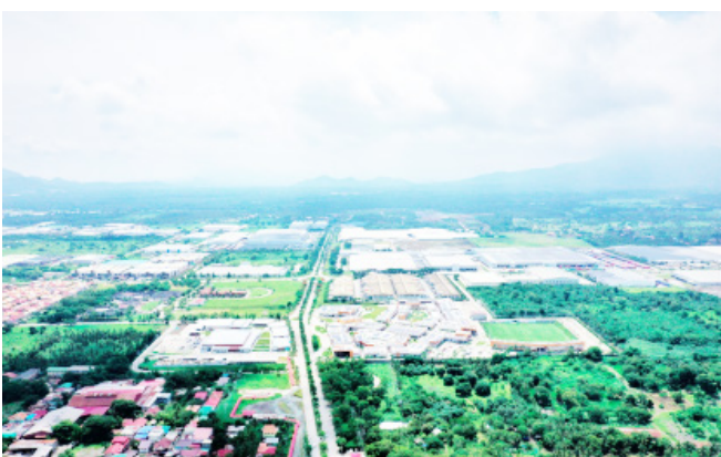
NEW JOBS. Aboitiz Group's Lima Land, Inc. will develop 100 hectares in Lima Estate in Batangas. New developments are projected to add 20,000 jobs in Region 4-A.

"With this expansion, Lima is well on its way to becoming a full-fledged smart city, supported by a complete ecosystem of infrastructure and the latest digital technology. A smart city in Calabarzon opens up a new wave of opportunities, with data at the forefront of improved operations across the city," Aboitiz Integrated Economic Centers first vice president