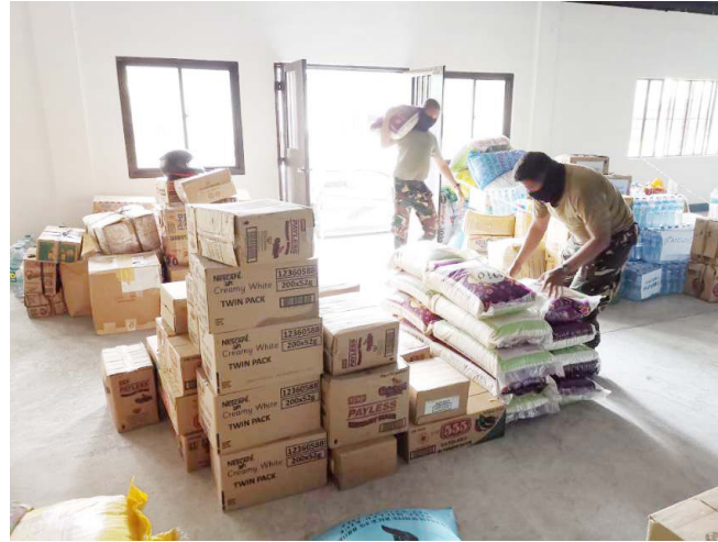
The relief items were stored at PAFCMOG Warehouse for subsequent ferrying to typhoon-affected areas