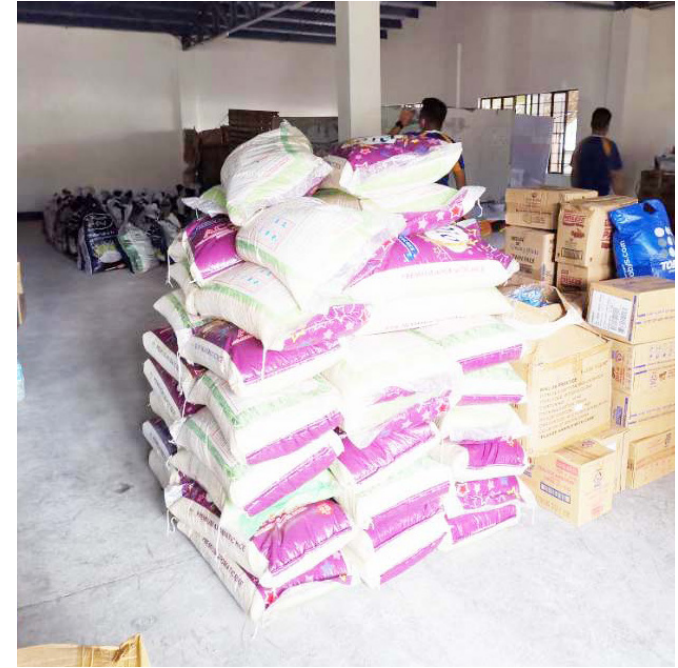
Food items such as sacks of rice, boxes of canned goods and instant noodles comprised most of the relief items ferried to CJVAB