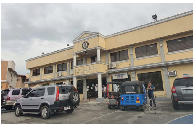
The Noveleta town hall in Cavite located at Barangay Poblacion was awarded Drug Free locality for two consecutive year.