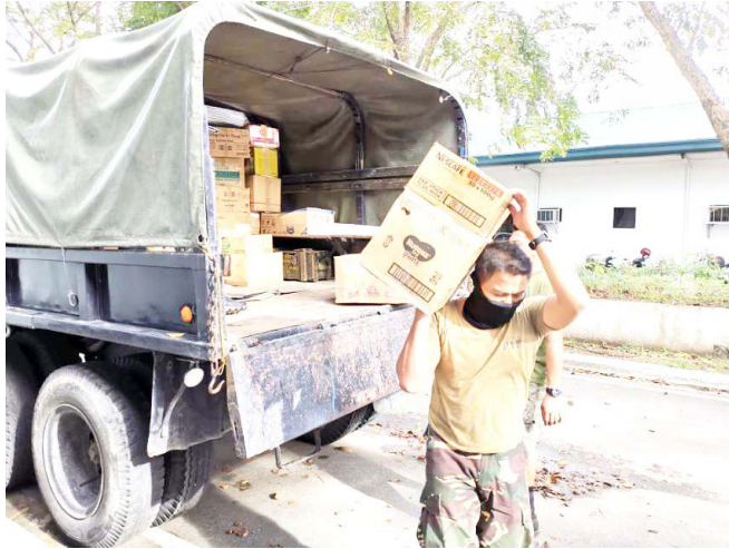
Relief items being unloaded at PAFCMOG, CJVAB, Pasay City