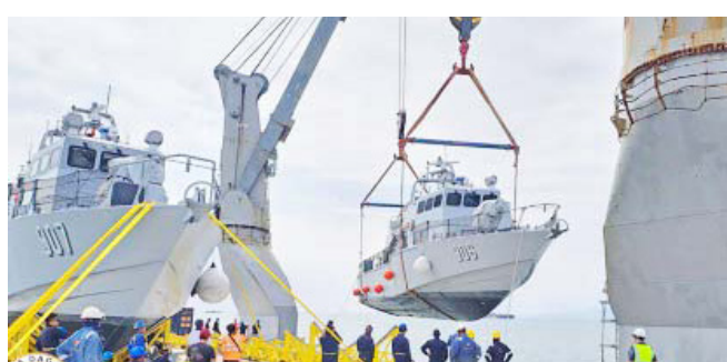
DELIVERED. Two fast attack interdiction craft (FAIC) platforms or the Acero-class gunboats are delivered to the Philippines from Israel at the East Commodore Posadas Wharf (ECPW), Cavite City on Nov. 18, 2023. The Philippine Navy now has six high-speed Acero-class gunboats, which can interdict surface threats and launch non line of sight missiles safely using the surrounding littoral areas as maneuver space and cover.