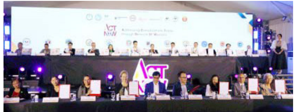
FIGHTING CKD. DILG Secretary Benjamin Abalos Jr. and representatives from AstraZeneca Philippines, various health advocacy groups and 12 provincial government units sign a memorandum of understanding (MOU) at the EDSA Shangri-La Hotel in Mandaluyong City on Tuesday (Dec. 19, 2023). The MOU provides for the expansion of the Addressing Complications Today through Network of Warriors (ACT NOW) for Chronic Kidney Disease program in 12 provinces -- Quirino, Aurora, Cavite, Quezon, Sorsogon, Samar, Capiz, Iloilo, Cebu, Zamboanga del Norte, Agusan del Sur, and Sarangani.

"I was informed that one machine will be serving 20,000 patients, and in the 12 provinces this machine and all will be serving close to one million patients. Let's thank AstraZeneca, it goes without saying for early screening of the CKD and that is why important to note that for each patient....spending PHP3,000 to PHP4,000 per test in ordinary hospitals so there will be a lot of savings. but then again I'd like to point out that I hope our governors are here so we can talk about