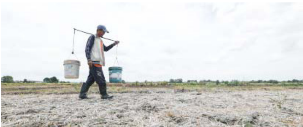
BRACING FOR EL NIÑO. A farmer walks along a dried rice field in Barangay Maname, Naic, Cavite in this May 3, 2023 photo. The government's Task Force El Niño is boosting efforts to mitigate the impact of the phenomenon, which now affects 41 provinces across the country.