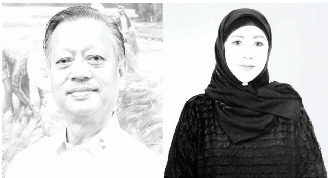
Photos show Social Security Commissioners (Ret.) Judge Manuel L. Argel, Jr. (left) and Bai Norhata Macatbar-Alonto (right).

State-run pension fund Social Security System (SSS) welcomes the appointment of (Ret.) Judge Manuel L. Argel, Jr. and Bai Norhata Macatbar-Alonto as the newest members of the Social Security Commission (SSC), the highest policy-making body of the Social Security System.