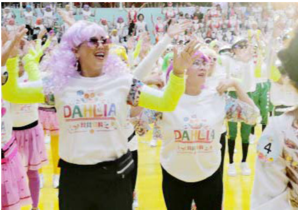
FINAL TOWN ANNIVERSARY. Zumba dancers display their energy and enthusiasm while performing a number to celebrate Carmona town's 166th founding anniversary on Sunday (Feb. 19, 2023). The Cavite town will officially become a city next year.

CARMONA, Cavite – Residents here celebrated the town's 166th founding anniversary for the last time on Sunday with various activities.