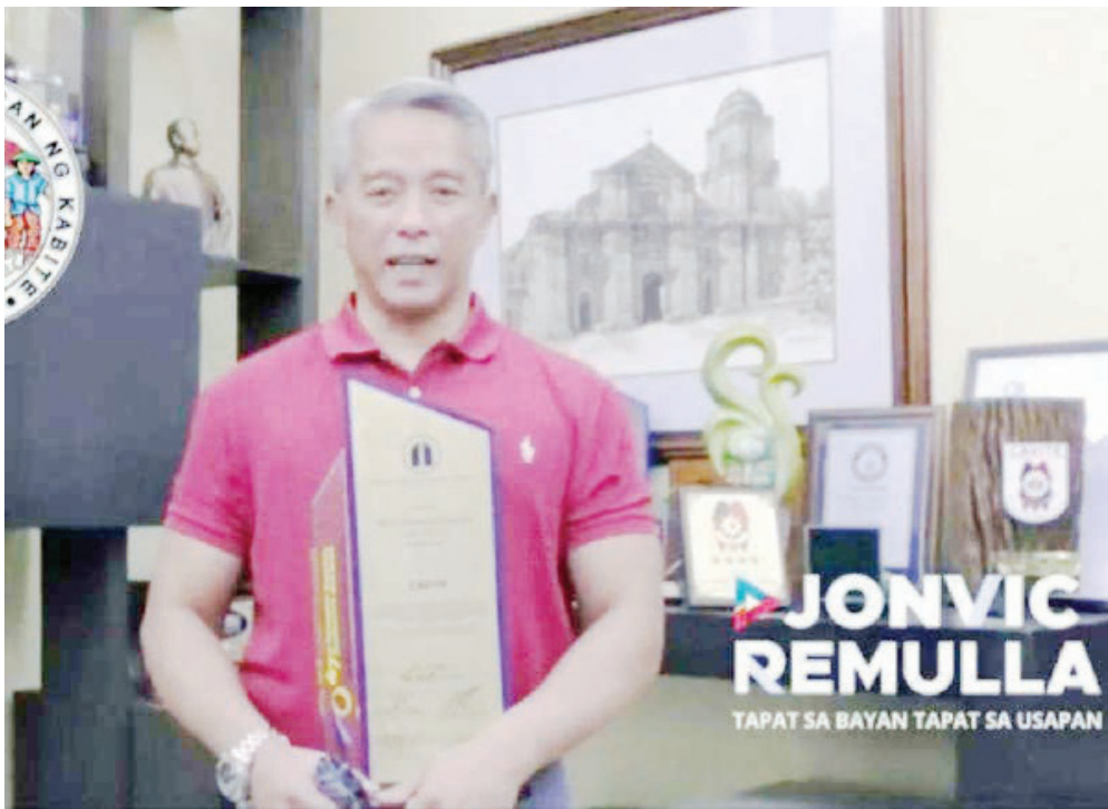
Gov. Juanito Victor 'Jonvic' Remulla accepts the award and expresses his appreciation to the Philippine Chamber of Commerce and Industry for the commendation given to the province as 2021 Most Business-Friendly Local Government Unit.

THE Province of Cavite was awarded as the 2021 Most Business-Friendly Local Government Unit (provincial category) during the 47th Philippine Business Conference and Expo held recently.