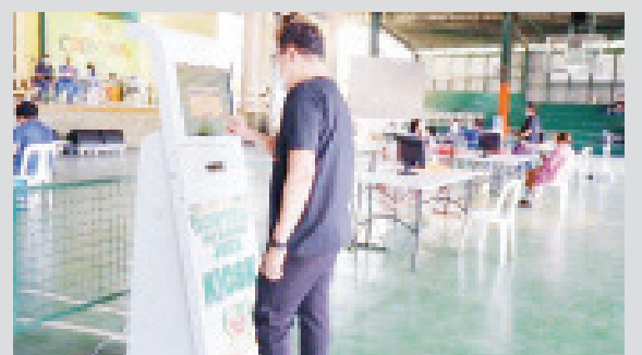
Sorteo Festival touch-screen kiosk at Hon. Marciano Mapanoo Park

CARMONA, Cavite – The local government unit (LGU) celebrated its 165th founding anniversary and launched its triennial Sorteo Festival at Hon. Marciano Mapanoo Park here on Sunday, Feb. 20.