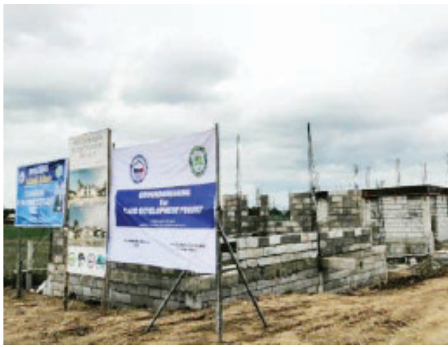
BETTER LIVING. The Department of Human Settlements and Urban Development (DHSUD) leads the groundbreaking ceremony for the construction of a housing project in San Leonardo, Nueva Ecija on Feb. 7, 2021. DHSUD said a total of three resettlement sites will be made available in the province.

The Department of Human Settlements and Urban Development (DHSUD) is providing more housing projects to ensure that all Filipinos will get access to better and decent living. In a statement Wednesday, DHSUD Secretary Eduardo del Rosario reiterated that the housing sector is committed to expanding resettlement projects nationwide, to make sure that all informal settler families (ISFs) residing in danger zone areas will be relocated to safe, decent, and resilient communities. Apart from giving them houses, Del Rosario said the government wants to make sure that ISFs will be moved to sustainable neighborhoods.