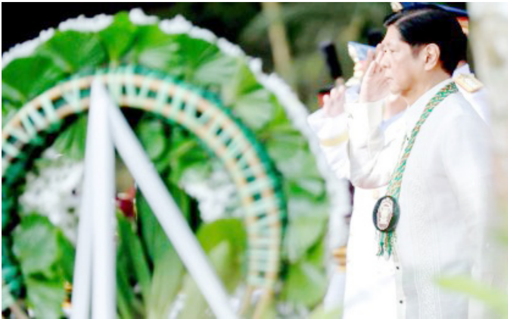
HONORING SAF 44. President Ferdinand R. Marcos Jr. on Thursday (Jan. 25, 2024) leads the Day of National Remembrance for the Heroic Sacrifice of 44 Special Action Force (SAF) personnel at Camp Castañeda in Silang, Cavite. A wreath was also offered at the Monument of the Fallen Heroes to honor the SAF4's bravery and heroism.

During the observance of the Day of National Remembrance at Camp General Mariano Castañeda in Silang, Cavite, Marcos called on his fellow