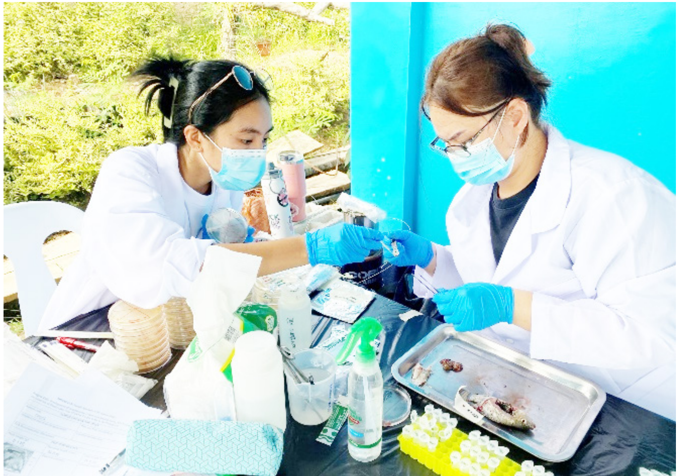
Project sample collection in Bohol.

The development of this vaccine is expected to establish a vital preventive measure and control program against TiLV outbreaks, addressing the significant mortalities they can cause. Moreover, it aims to serve as a reference for policy making to enhance aquaculture practices within the tilapia industry.