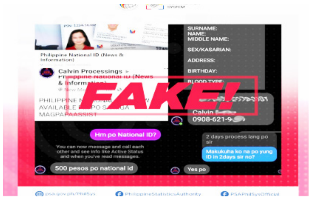
SCAM. The Philippine Statistics Authority warns the public against scammers posing as employees facilitating registration for the Philippine Identification System (PhilSys) in this undated infographic. It also reminds the public that the registration under PhilSys is free of charge.

In an advisory on Saturday, the PSA said it has been receiving reports that some individuals have been posing as part of the PhilSys team, who are unlawfully processing the Philippine identification card (PhilID) with corresponding charges.