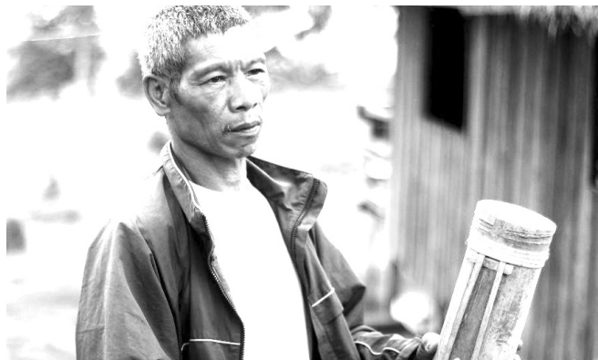
A Datu plays the takumbo (parallel-stringed zither)