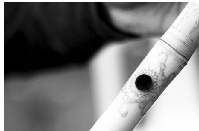
Ornate patterns etched on a bamboo flute