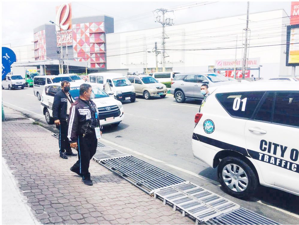
File photo from Dasmariñas Traffic Management Unit's Facebook page (MANILA BULLETIN)