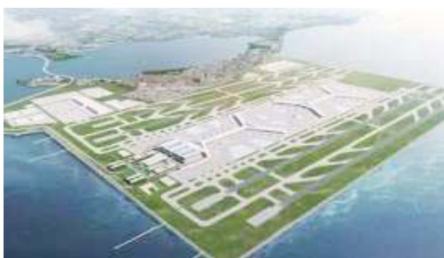
MacroAsia must prove capability to fund Sangley airport project

Lucio Tan's MacroAsia Corp. has to prove to the Cavite government that it still has the financial muscle to fund the first phase of the massive Sangley Point International Airport (SPIA) project before it can proceed with the development together with its Chinese partner.