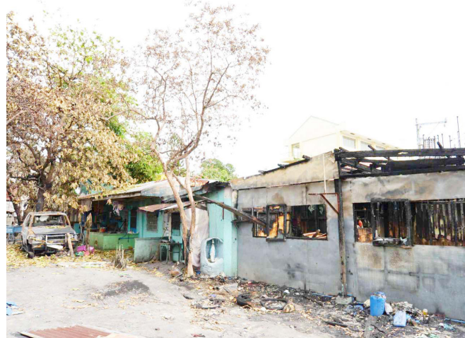
One of the structures that caught fire in Bacoor City.

In an effort to help affected residents recover from a fire incident at Barangay Salinas 1 in Bacoor City, Cavite, an outreach team from the Office of Senator Christopher "Bong" Go visited the area to provide immediate aid in a distribution activity held at the Salinas 1 Elementary School on Friday, January 8.