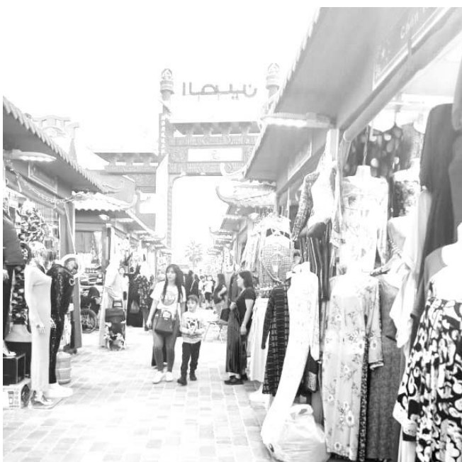
Sa bumabangon / P2

Nababalor ngayon ng pag a alinlangan ang mga negosyante at maging ang kanilang mga costumer sa kung tuloy na nga ba o ipinagbabawal pa ang pag-papatuloy ng operasyon ng ibat ibang mga negosyo sa lunsod ng Tagaytay. Mabuti pa ang road signage na ito na tiyak ang sino mang motoristang nagyayaot kung susunod lamang ng tama ay may tiyak na patutunguhan. Ngunit ang magka kontrang pahayag ng pamunuan ng Department of Interior & Local Govt (DILG) pati na