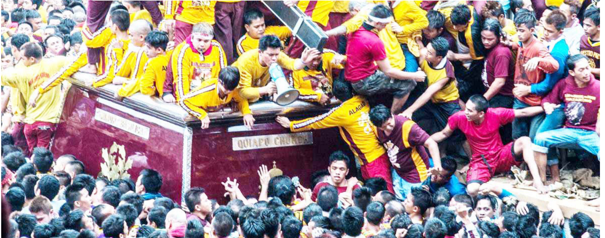
Traslacion photo courtesy of Mr. Allan Borebor