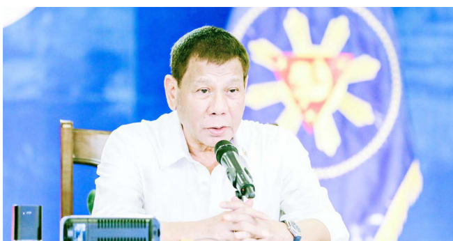
President Rodrigo Roa Duterte

The rest of the country will remain under modified general community quarantine (MGCQ), the most re-