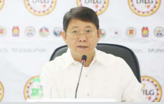
DILG Secretary Eduardo Año. (File photo)

There is no need to impose a stricter lockdown as long as there is no proof that the new strain of the coronavirus disease 2019 (Covid-19) from the United Kingdom