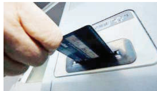
BSP warns of fake bills from ATMs

The Bangko Sentral ng Pilipinas (BSP) yesterday urged Filipinos to carefully inspect bills dispensed by automated teller machines (ATMs).