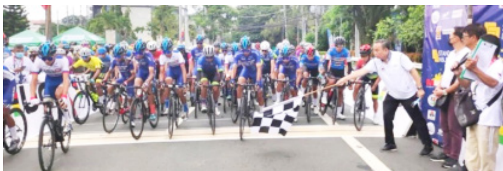
FLAG OFF: Philippine Olympic Committee and PhilCycling president Abraham Tolentino leads the ceremonial kickoff of the National Championships for Road in Tagaytay City in this June 2022. The 2024 PhilCycling National Championships for Road will be held from Feb. 5 to 9 in Tagaytay City.