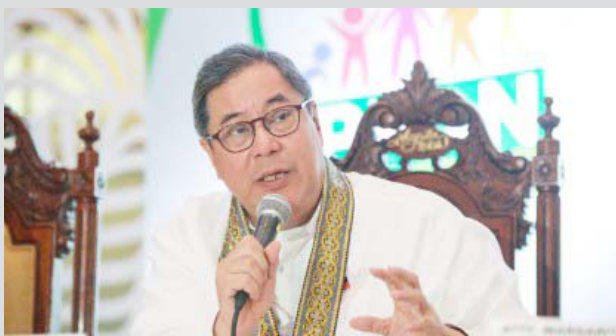
Health Secretary Teodoro Herbosa

The Department of Health (DOH) continues to improve its mandate of bringing quality healthcare services to all Filipinos nationwide. For the year 2023, the agency was busy on the establishment of healthcare facilities, especially in the provinces, that would provide state-of-the-