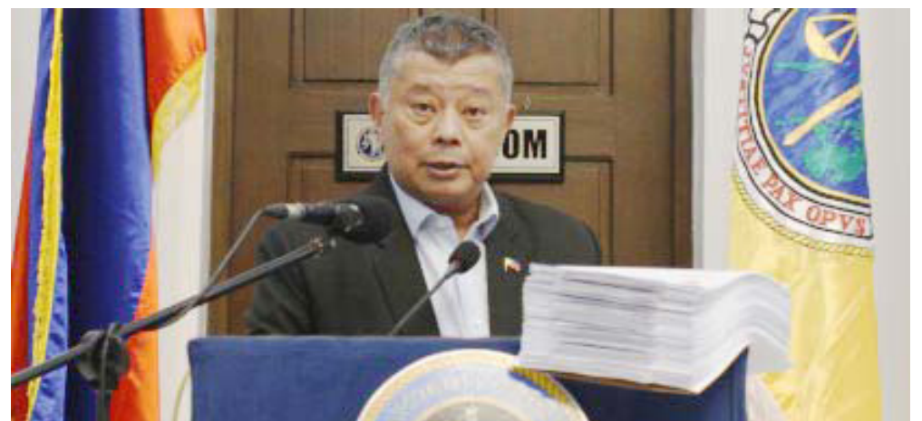
Justice Secretary Jesus Crispin Remulla (File photo)

The government has also mounted a crackdown on human trafficking amid controversies over the extent of the power of immigration officers to hold an outbound