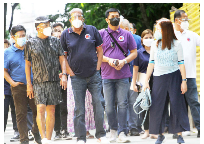
Department of Transportation (DoTr) Secretary Art Tugade visits Dasmariñas City to hold a dialogue with the members of the transport groups. He paid a courtesy call to 4th District Representative Pidi Barzaga and Dasmariñas City Mayor Jenny Austria-Barzaga.