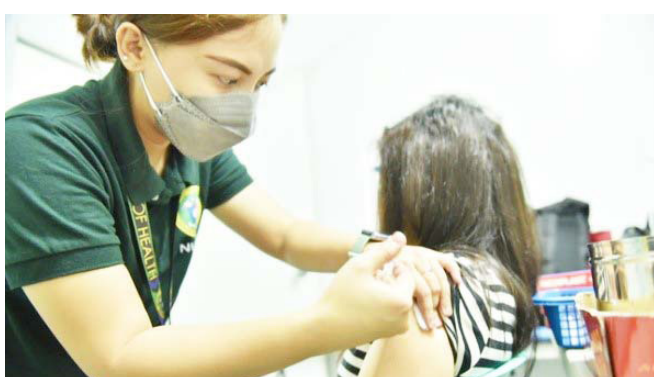
Cavite Governor Jonvic Remulla says that though they are still waiting for the approval of the Emergency Use Authorization of Novavax, the province has finalized orders for the vaccine Cavite Governor Juanito Victor “Jonvic” Remulla Jr said in an address via Facebook Live